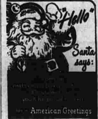
Nichols News Stand Depot Square

Manassasquog Tribe, Improved Order of Red Men, and Sunset Council, Degree of Poobahs, will hold their joint annual children's Christmas party in Tanker hall Sunday afternoon starting at 2:30 o'clock. This year the party will be strictly for the children's enjoyment. Parents are asked to bring a gift for the Christmas tree and mark it "boy" or "girl" so that each child will receive the appropriate kind of gift. Santa Claus will be present to distribute the presents.